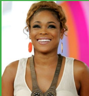
TIONNE 'T-BOZ' WATKINS